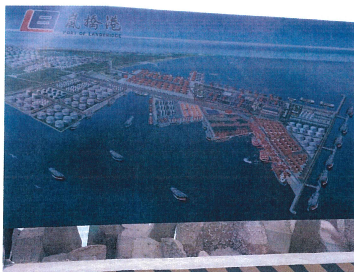
Landbridge Rizhao Port complete design concept