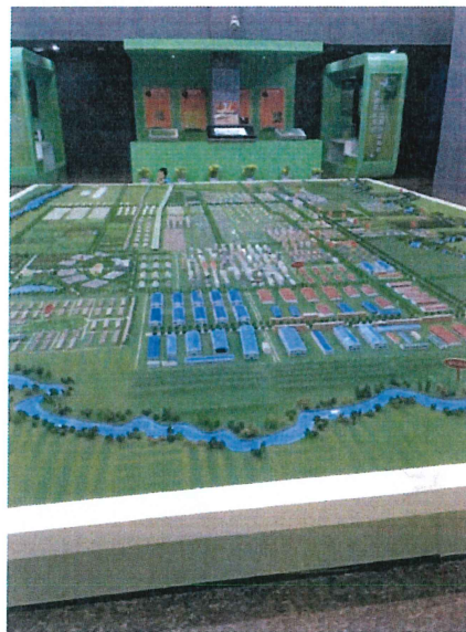
Yangling Agriculture Hi-Tech Industries Demonstration Zone model