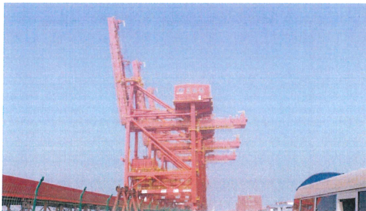
Mineral unloading facilities at Rizhao Port

During the Forum's site visits, the NT delegation witnessed the development of new facilities designed to accommodate the expected increase in exports of NT agricultural and mineral commodities over coming years, arising from the lease of the Port of Darwin to China's Landbridge Group. One of this site visits was to Landbridge's own port in Rizhao, capable of high-volume handling of bulk commodities. Another site visit was to the new Australia-China Industrial Park in Rizhao, which will include extensive refrigerated storage facilities for food imports.