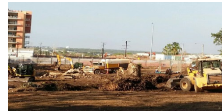
What is to be done?