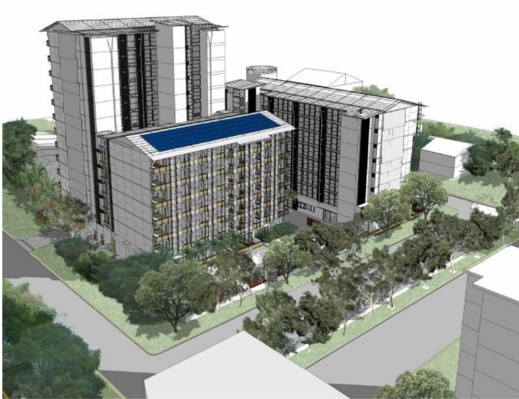
AERIAL VIEW FROM SMITH STREET & PACKARD PLACE