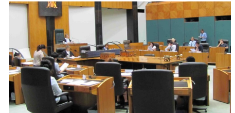
Step Up Be Heard program

PARLIAMENTARY EDUCATION SERVICES (08) 8946 1414 OR (08) 8946 1417 Email: ntparliament.edu@nt.gov.au Facebook: LegislativeAssemblyNT