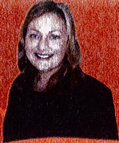
Delia Lawrie LEADER OF THE OPPOSITION