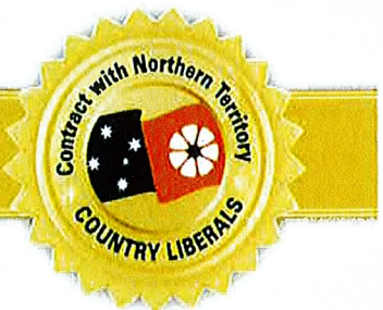
Terry Mills MLA Leader of the Country Liberals

Terry Mills and the Country Liberals have a STRONG, 5-POINT PLAN