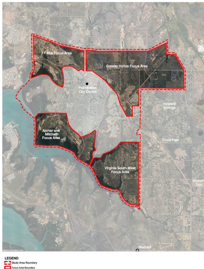
Figure 1: The Study Area

Q1. The image above shows the study area for the draft Subregional Land Use Plan. Is there anything about the study area that you would like us to know?