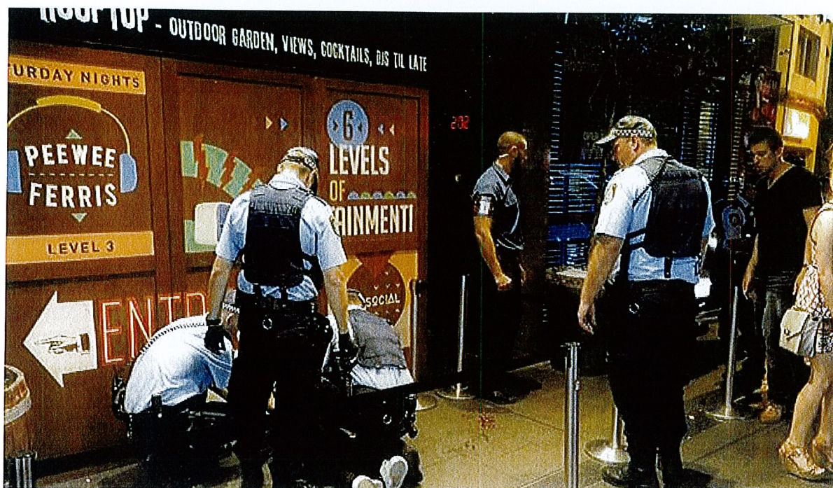
A man is restrained following a weekend fight at the Kings Cross Hotel.

The latest Bureau of Crime Statistics for the first quarter of this year show there were six alcohol-fuelled assaults in the Kings Cross police command in March. But there were 45 assaults — 20 alcohol-related — outside licensed premises in Kings Cross a month after the lockout laws came into effect. This is nearly double the number of assaults outside licensed premises in February (26).